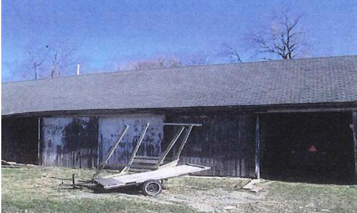
Building 3B – Wagon Shed

This building measures 25 ft. X 138 ft. for a total area of 3,459 sq. ft. the one-story wood-framed shingled building sits on a rubblestone foundations. It has a gable-style asphalt shingled roof and cedar shake siding. It has eight sliding barn doors on its west side.