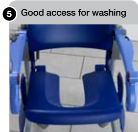
5 Good access for washing

While one of the two rechargeable batteries is powering Carino , the other is in the charger, so the hygiene chair is always available for use.