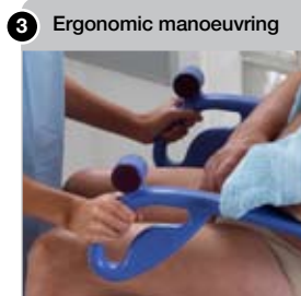
3 Ergonomic manoeuvring

Unique, adjustable 'swing away' leg-rests self-adjusts in an optimum balanced position for individual resident comfort and support sound ergonomic working routines.